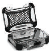
Lexan panel kit