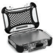
Aluminum panel kit