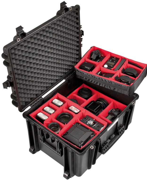
Photo cases made in injection molded PP material. Equipped with three padded dividers sets to store professional camera gears.