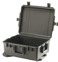
iM2720-X0000 No Foam