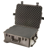
iM2720-X0001 With Foam