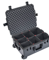
iM2720-X0006 With TrekPak Divider System