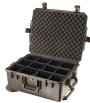
iM2720-X0002 With Padded Dividers