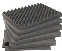
iM2720-FOAM 5 pc. Replacement Foam Set