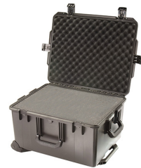
iM2750-X0001 With Foam