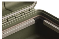
iM27XX-M4-BEZEL Base Bezel (Metric)