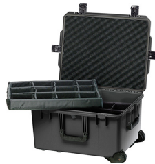
iM2750-X0002 With Padded Dividers