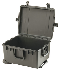
iM2750-X0000 No Foam