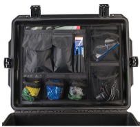
iM27XX-UTILITYORG Utility Organizer